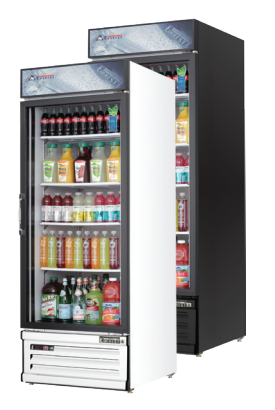
EMGR24 | EMGR24B